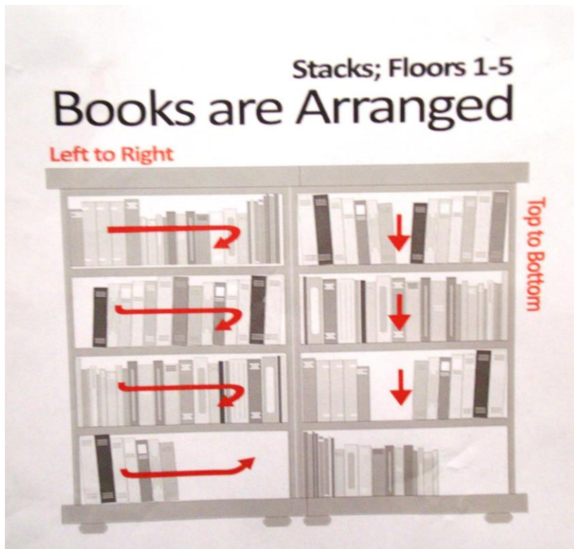
Figure 6. Directionality. A notice posted in the shelving area of a university library makes explicit the organization of books according to directionality of Latin alphabetization, from left to right, as opposed to organizing right to left, as would be expected in a system based on Arabic alphabetization.