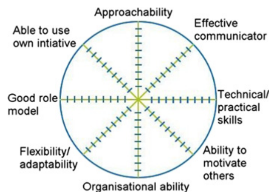
Figure 1 The modified self-assessment wheel for the practice educator/mentor

In preparation for using the wheel, the role of PE was broken down into skills that, first, were important and, second, were quantifiable. Eight aspects of the practice educator role were identified by using a range of PE job descriptions and through intensive consultation with existing practice educators. A consensus was reached on the eight aspects: approachability, effective communication, technical/practical skills, ability to motivate others, organisational ability, flexibility/adaptability, good role model and ability to use own initiative. Each aspect was then placed at a spoke of the wheel (Figure 1).